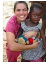
Bring the Love of Christ to all peoples

7-10 PM - Gather all you've learned thus far and take it to a new level.