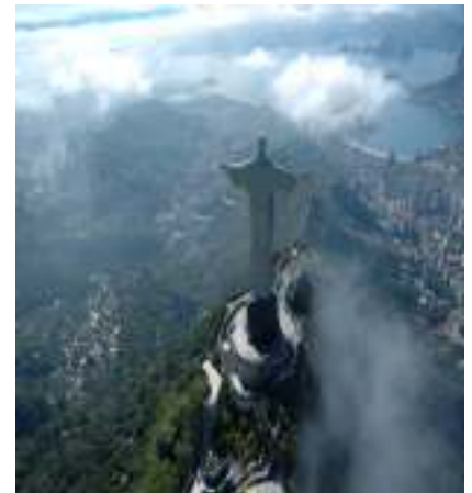
Cristo Redentor (Christ the Redeemer) Corcovado Mtn. Rio de Janeiro, Brazil

Copyright© 2010 by the Christian Century. Reprinted by permission from the March 23, 2010, issue of the Christian Century. Subscriptions: $49/yr. from P.O. Box 700, Mt. Morris, IL 61054 (800)208-4097.