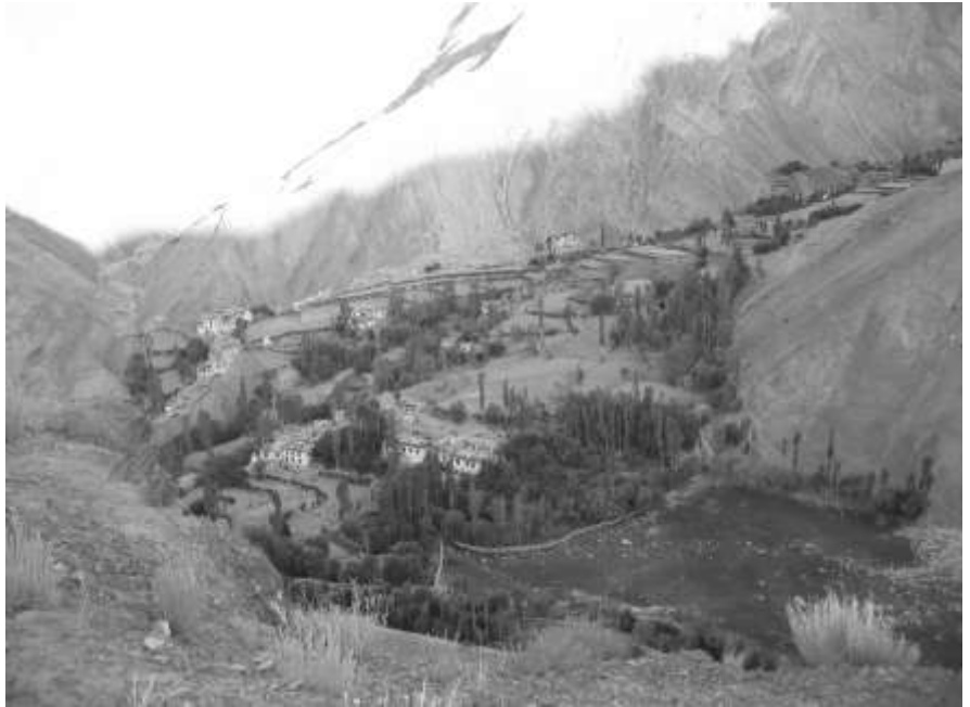
The village of Skindiang in Ladakhi

“The whole tract of land at our feet was rich with vegetation, appeared as one uninterrupted garden, watered by many rivulets: high stone walls, surmounted by hedges, formed enclosures for fruitful grain fields. Thick, velvety turf, and the shade of very ancient apricot trees, invited us to repose....Set on its own high hill, Poo is surrounded in its immediate environs by much loftier summits that tower to a dizzying height from four to five thousand feet above the village. Beside the fact that the high Himalayan passes were not the easiest to trek through any time of the year, they were absolutely impassable to the traveler for a good part of the year. In short, Poo was about as isolated a place to reach as one could imagine. Yet once having reached it, it was like stepping into a