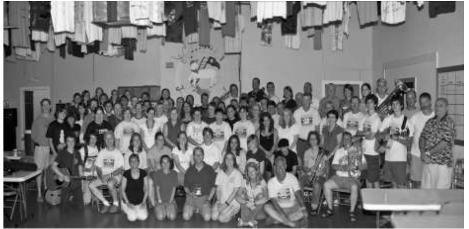
Work crew team of Raleigh Moravian and other churches at Camp Victor, June 2008

A call to action? Is there still work to be done in the Gulf region? Gosh, Katrina