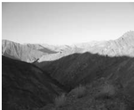
Looking out over the Himalayas, North India

Skindiang is a small village about 80 miles outside of Leh, the capital of Ladakh where there is a Moravian Church and School. Roughly two hundred people live there, and it is terraced land down between two streams of glacial water, where they plant their crops and gardens. Their lifestyle has hardly changed over the centuries, except one now sees an occasional TV satellite dish Continued on Page 6