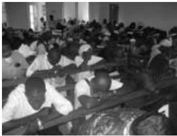
Prayer at the Dedication Service

The Dedication Service began with more music, scripture readings, and letters of greetings from Little Church on the Lane and Fairview Moravian.