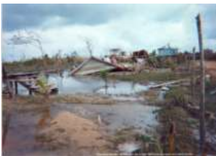
Devastation leaving homelessness from Hurricane Felix

Either way, it is God at work in us all, revealing more of Himself to us as we continue to live out our lives as His children. He has set before us a choice. Shall we continue to seek more of Him and to bring the Good News of His sacrifice for us to a world desperately in need of the Savior? Romans 12:1-2.